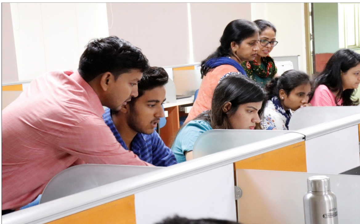
Participants attending workshop (second day) in Computer lab.