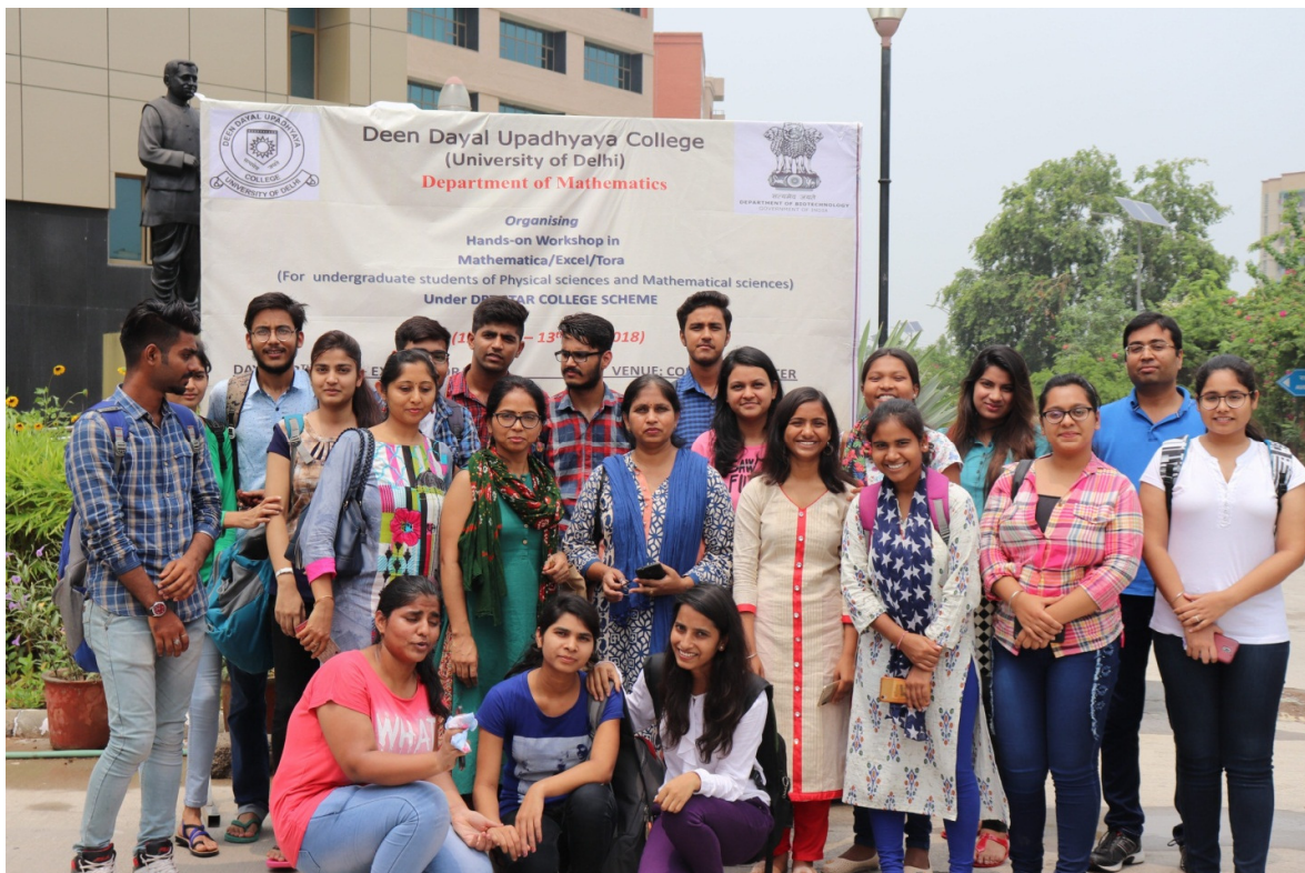
Group photograph with participants.