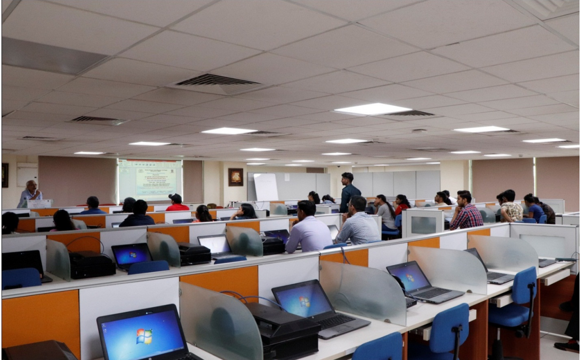
Participants attending the session in the computer center.