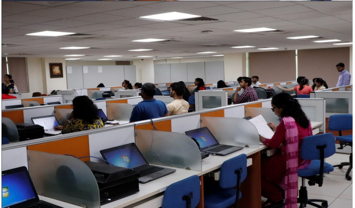
Participants attending technical session in computer center.